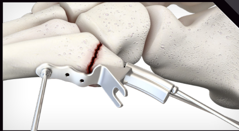
REDUCTION AND PLATE ALIGNMENT

INTELLIGENTLY DESIGNED GUIDED BY INNOVATION.