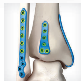
POSTERIOR FIBULA, POSTEROLATERAL TIBIA AND MALLEOLAR HOOK

For more information or to schedule a case, contact your Medline UNITE representative, or visit medlineunite.com .